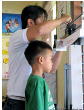
Height and weight measurement