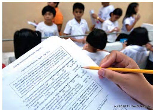
EHCP School Survey

In order to institutionalize the links between research and programming, Fit for School created a new monitoring and evaluation (M&E) department with permanent staff. The new M&E Coordinator is assuming a supervisory role for the research but also works closely with the management and the field personnel. This department has been crucial in the final development of the EHCP Survey as well as of a new tool to guide project officers' activities. These capacities and tools are very important for evidence-based management and programming, benchmarking activities, communicating results and establishing Fit for School further as an authority and leader in the area of effective management of school health programs.