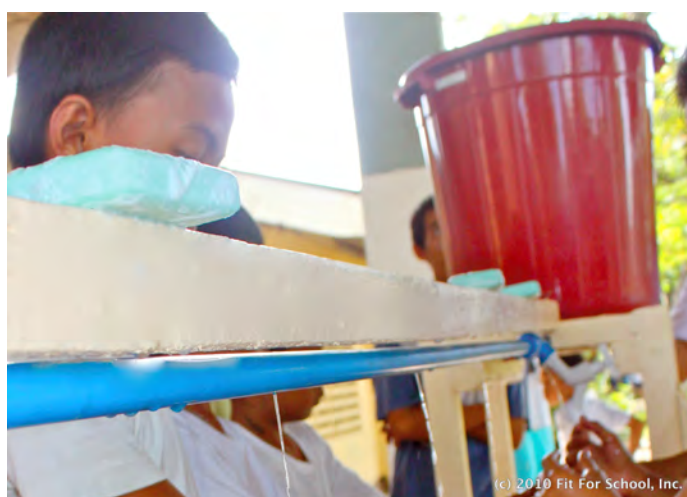
Prototype facility in use