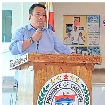
Governor Jesus J. Juraldo of Camiguin Province

In close cooperation with GlaxoSmithKline (GSK) Philippines, Fit for School facilitated collaboration between DepED and the Department of Health (DOH) in order to harmonize the different deworming programs and avoid overlap of various deworming activities.