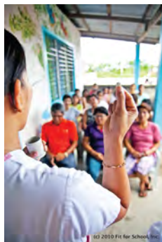
Deworming program in schools and day care centers