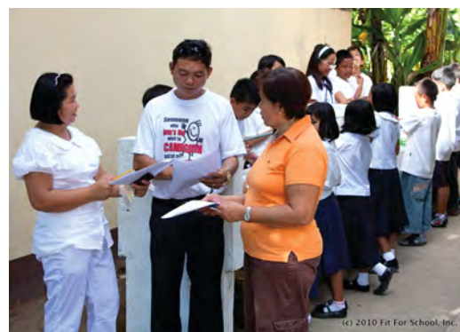
Monitoring team using the EHCP school survey

In collaboration with DepED and GSK, Fit for School launched the EHCP Survey, a process monitoring tool at school-level, during September's summit in Dumaguete. This tool had been developed for the last two years and enables all stakeholders at the school level (teachers, school principal, parents and community representatives) to commonly assess the quality of program implementation and identify room for improvement. Using the tool, DepED's Regional and Division Offices can easily assess program coverage and implementation quality.