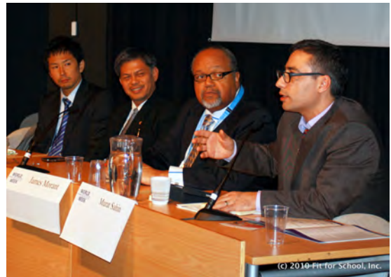
WORLD WATER WEEK: DepED Sec. Br. Armin A. Luistro FSC presenting the EHCP (left photo); Sec. Luistro with the other delegates (right photo)