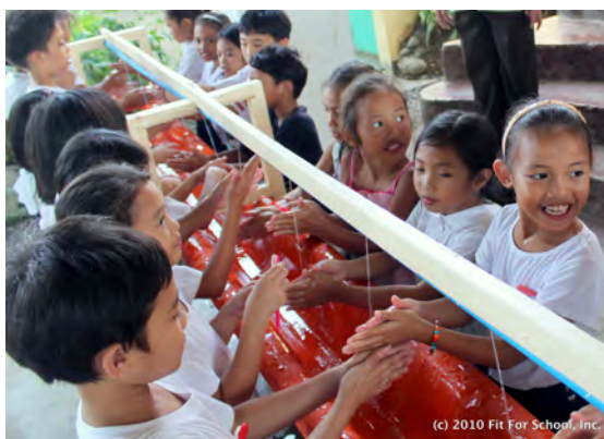
Elementary school students performing group handwashing