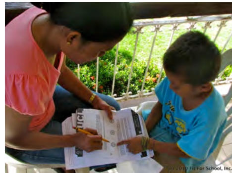
Quality of life interview

The Weight Gain Study research, a collaboration between University College London, the World Dental Federation and Fit for School, demonstrated the impact of oral health on general health indicators by showing that underweight children's nutritional status improves significantly after the extraction of infected teeth. This study provides the evidence on the importance of oral health on general health.